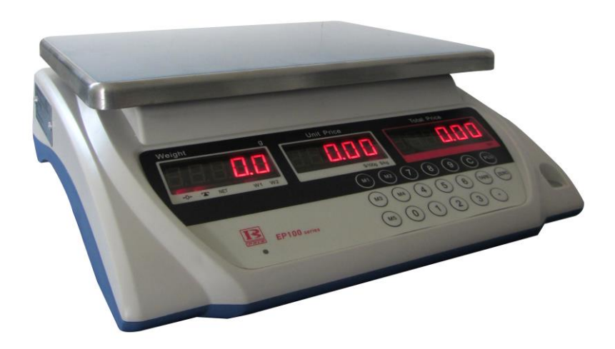
Figure 1 EP100 scale.