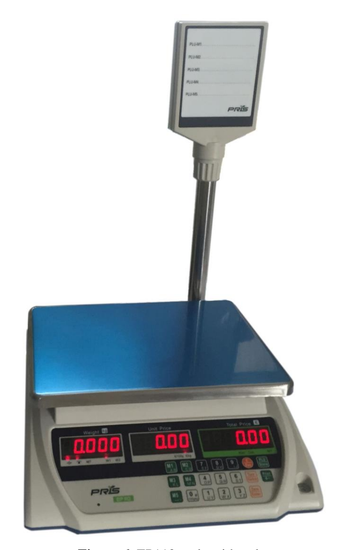
Figure 6 EP110 scale with pole.