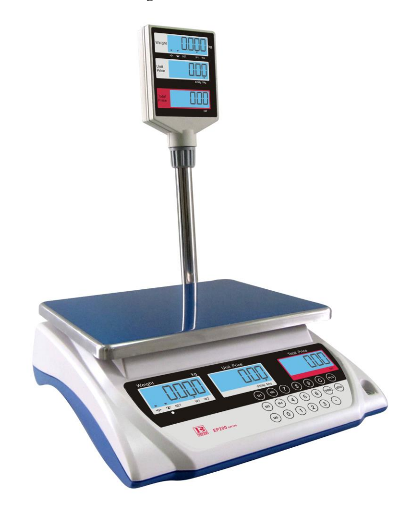
Figure 4 EP200 scale with pole.