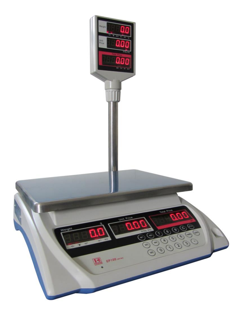
Figure 2 EP100 scale with pole display