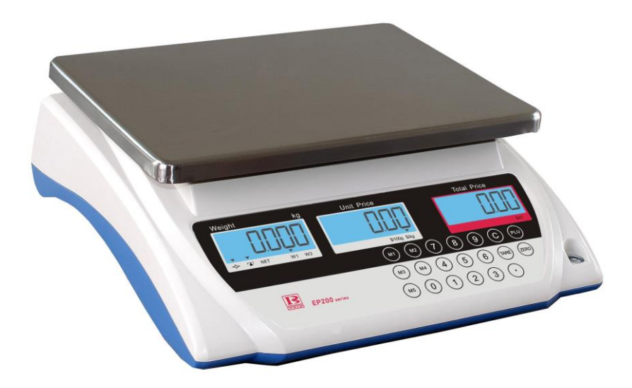
Figure 3 EP200 scale.