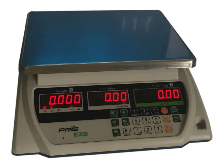
Figure 5 EP110 scale.