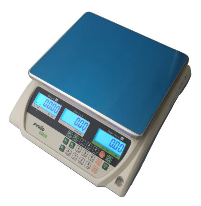
Figure 7 EP210 scale.