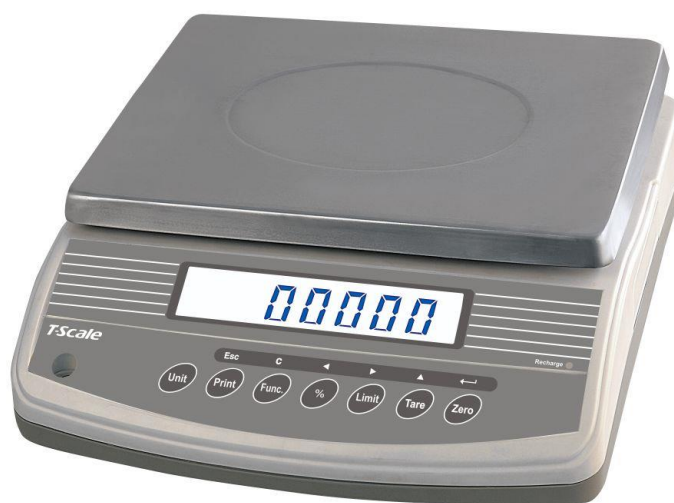
Figure 7 QHW.