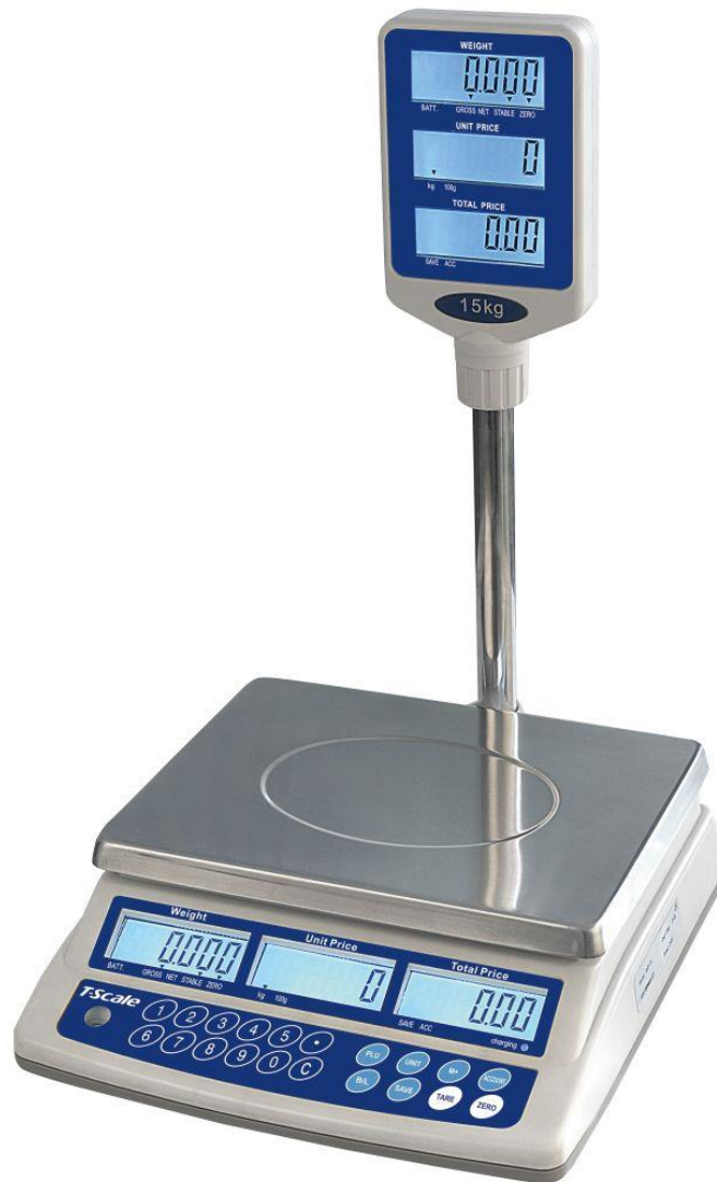
Figure 1 ASP.