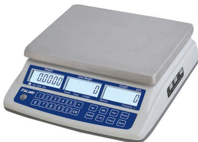
Figure 4 AHC.