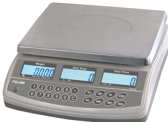
Figure 6 QTP.