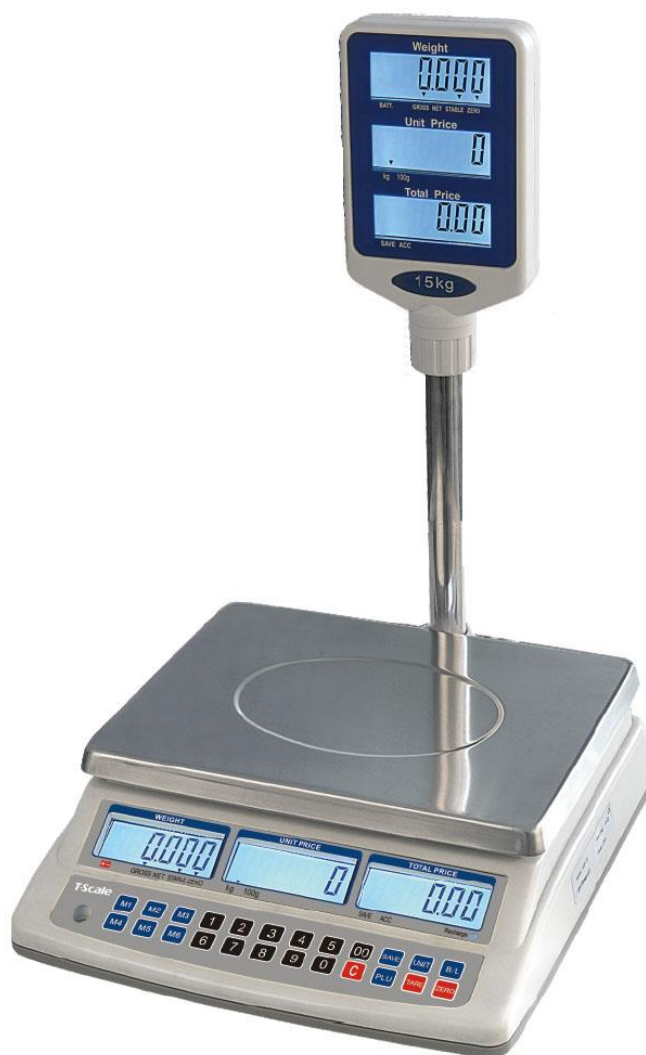
Figure 10 AHPS.