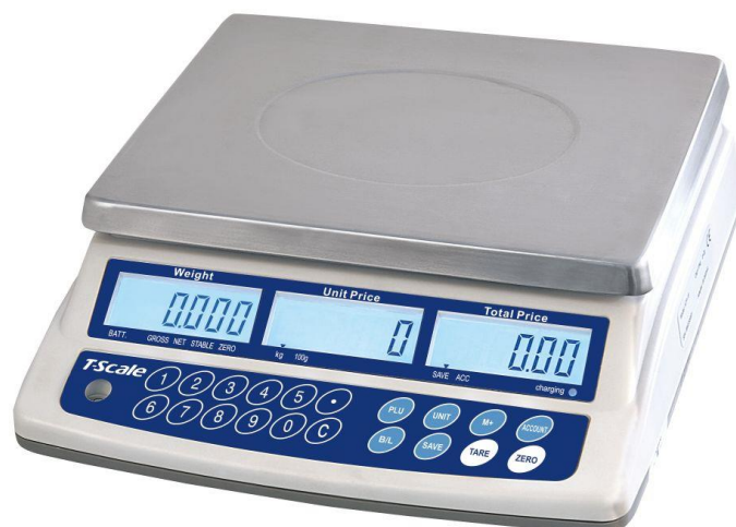
Figure 2 ATP.