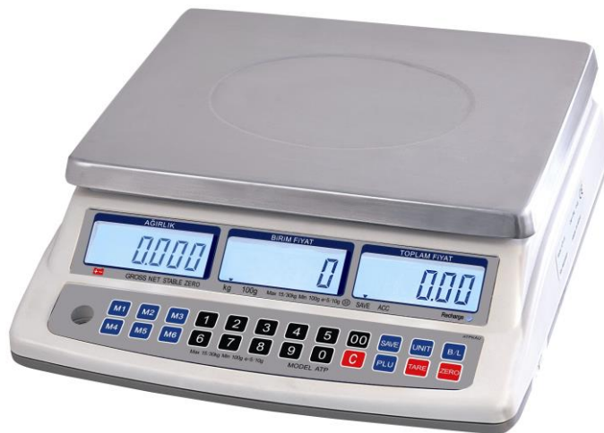
Figure 9 AHP.