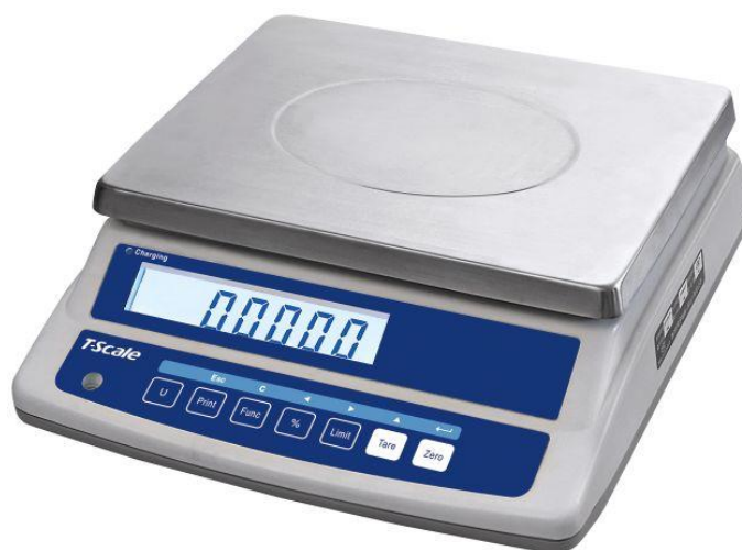
Figure 3 AHW.