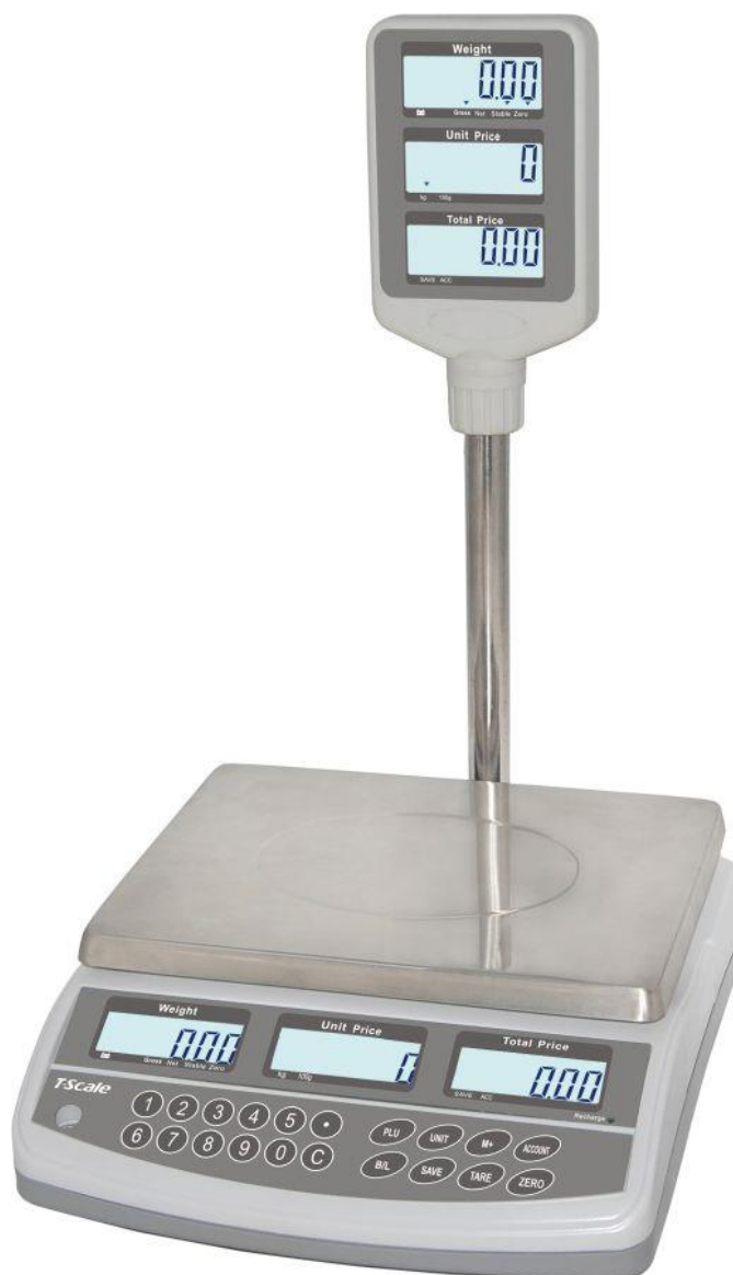
Figure 5 QSP.