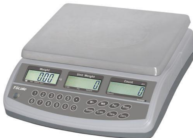
Figure 8 QHC.