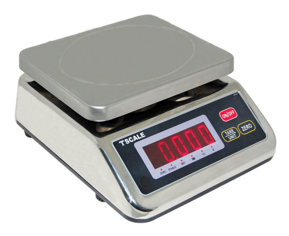
Figure 2 S29 scale with LED display.