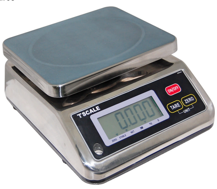
Figure 1 S29 scale with LCD display.